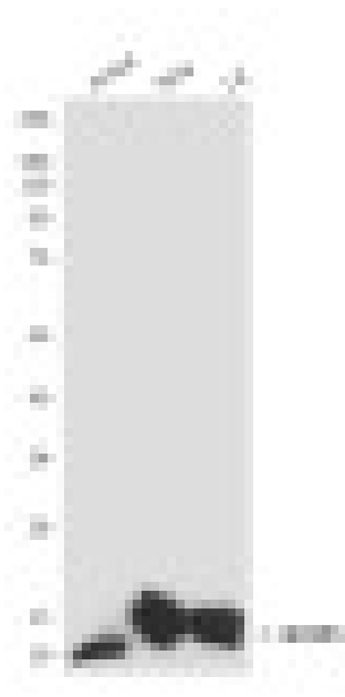
Western blot analysis of 4E BP1 in C2C12, A549 and 3T3 lysates using 4E BP1 antibody